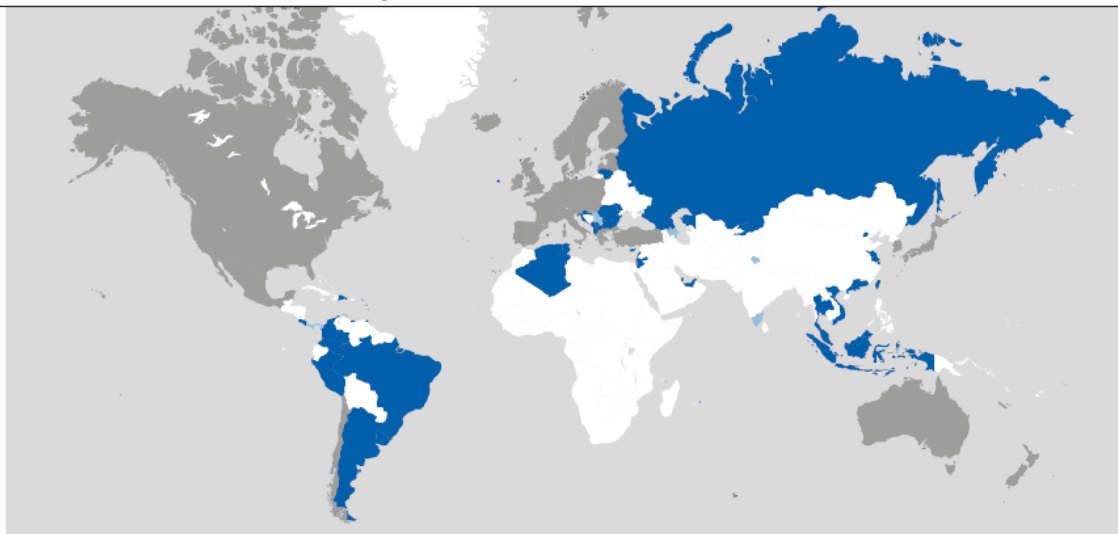
Map of PISA countries and economies