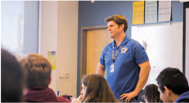
Socioemotional Learning, USA, Facebook and Yale Center for Emotional Intelligence