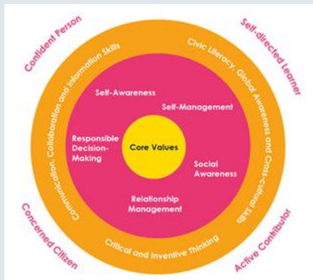
Figure 1. Singapore's Framework for 21 st Century Competencies and Student Outcomes