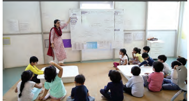
Learning to Learn, India, Interdisciplinary learning