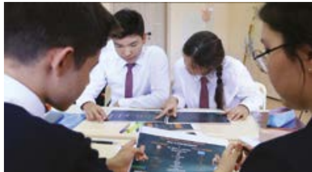
Data Literacy, Kazakhstan, Mathematics