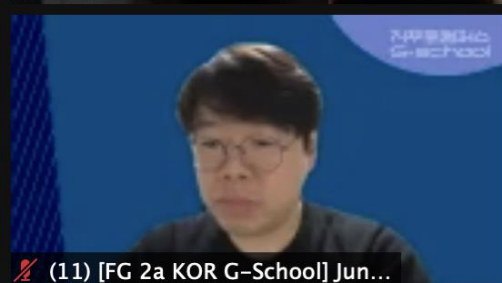
(11) [FG 2a KOR G-School] Jun...