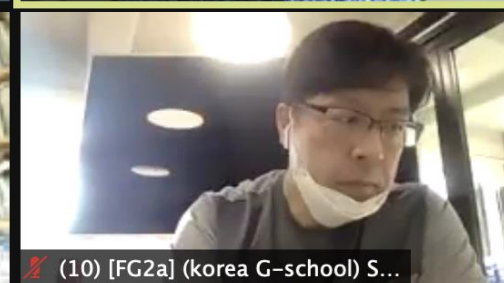
(10) [FG2a] (korea G-school) S...