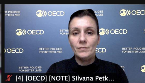
[4] [OECD] [NOTE] Silvana Petk...