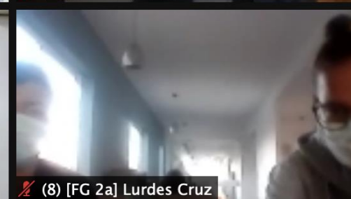
(8) [FG 2a] Lurdes Cruz