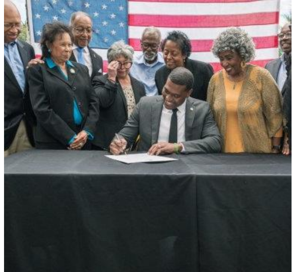
EPA Administrator Michael S. Regan signs document officially creating the new Office of Environmental Justice and External Civil Rights.