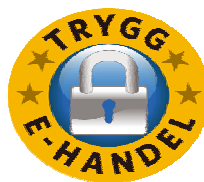
Figure 2. An example of a trust mark: Svensk Distanshandel in Sweden