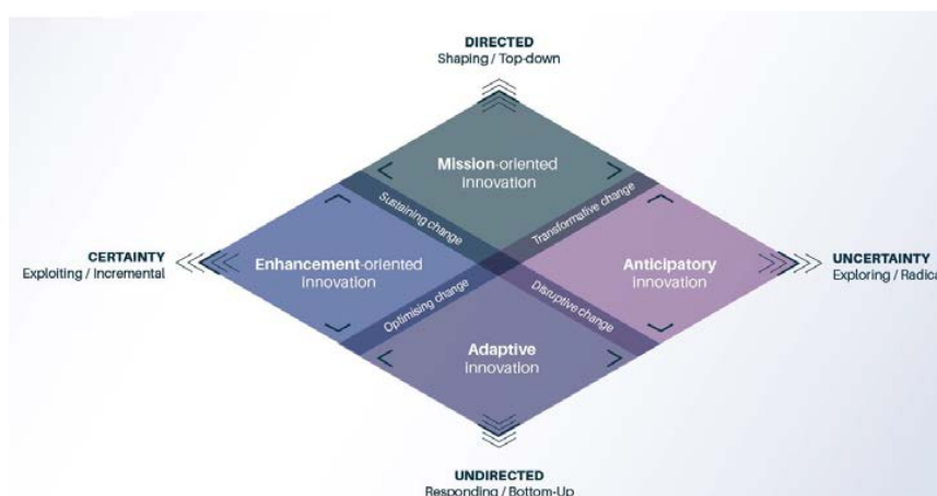
Figure 3.2. OECD Public Sector Innovation Facets Model

The facets model can help consider the mix of innovation activity taking place and whether there is a sufficient diversity of approaches. Given that innovation is inherently uncertain with no guarantee as to what will succeed, multiple “bets” need to be made to ensure alternative options even if the favoured interventions fail to obtain the desired or needed results. A portfolio is therefore required to reduce risk.