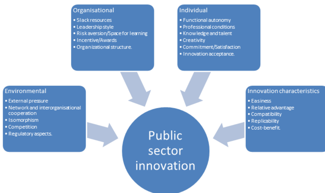
Figure 3.1. Levels and influential factors for public sector innovation