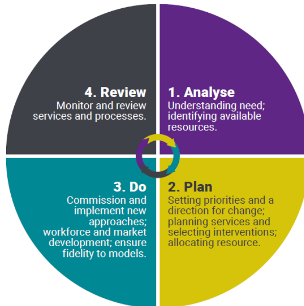
Figure 3. Steps in an effective commissioning cycle